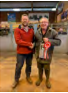
First Prize Dairy Bull RG Abbott & Son